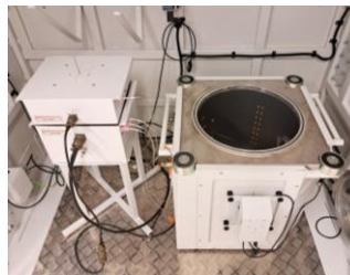
Standard calorimeter (left) and