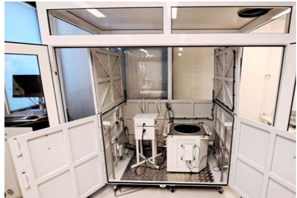
THT EV+ Accelerating rate calorimeter system at VTT.

Collection and composition analysis of the exhaust gases released during battery fire.