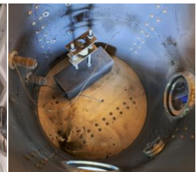
Cylindrical cell stand inside the EV+ calorimeter.