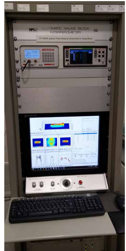
Figure 3. Upgraded electronics cabinet and GBI software.